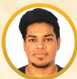
LALIT YADAV IBPS RRB PO 2023

It's Your Turn Now Take A Free Mock Test