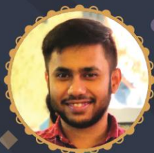
Ritwick Das IBPS PO & CLERK 2022

It's Your Turn Now Take A FREE Mock Test