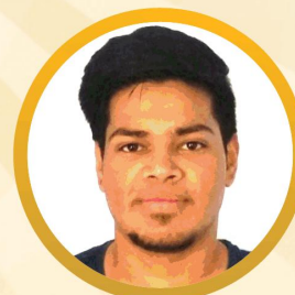
LALIT YADAV IBPS RRB PO 2023

It's Your Turn Now Take A Free Mock Test