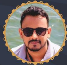
Aqeeb Ayaan IBPS PO 2022