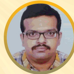
DEBAYAN BHAUMIK IBPS PO 2023 RRB CLERK 2023

It's Your Turn Now Take A Free Mock Test